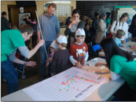
Children enjoy learning from IOG students how the brain works.