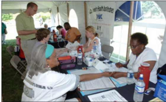
Seniors receive free health screenings at all Healthier Black Elders receptions.