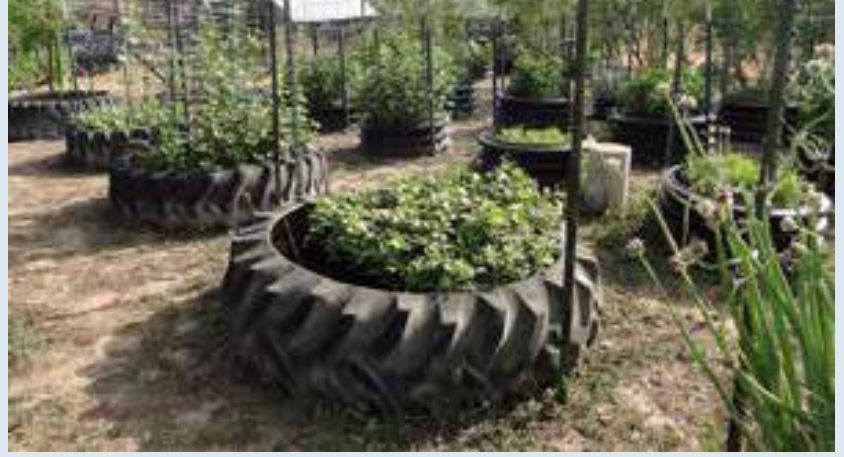
A new research project will study how older adults "cultivate life" through gardening.