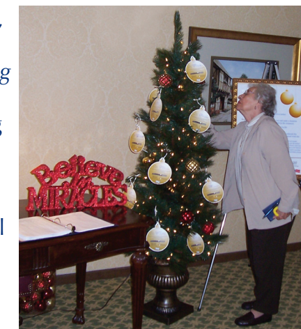
2009 Holiday Hope Tree: an American House resident chooses a gift to donate to a senior in need.

On November 4th, every American House Senior Living Community will hold a tree lighting ceremony and invite residents, friends, family members and local area businesses to join in this celebration – and to raise the much needed funds to support our seniors. Over 100 volunteers from American House, Lighthouse and Wayne State University will join together to deliver the items during the first two weeks of December.