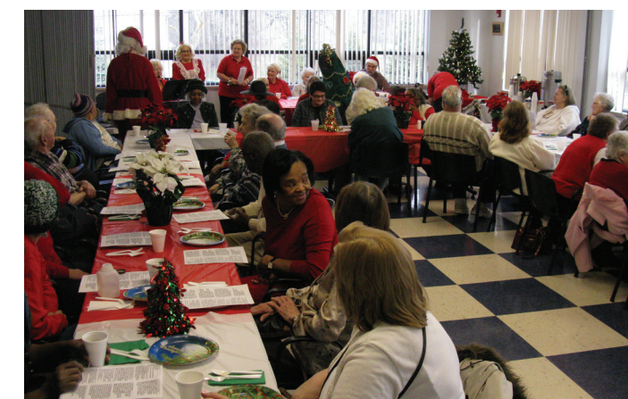
2009 Holiday Hope Luncheon at Lighthouse of Oakland County.

In its 2nd year, the goal of this program is to raise $75,000 to provide food, gifts and items of need for over 250 area seniors, all identified by Lighthouse of Oakland County .