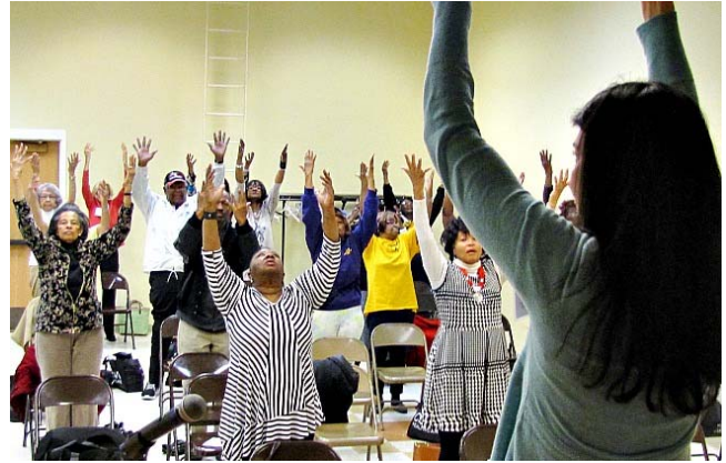
Chair Yoga class at Art of Aging 2016

The conference is held April 27, from 9 am – 1:30 pm in Detroit's Fellowship ( http://www.iog.wayne.edu/events/2017_artofaging_web.pdf )