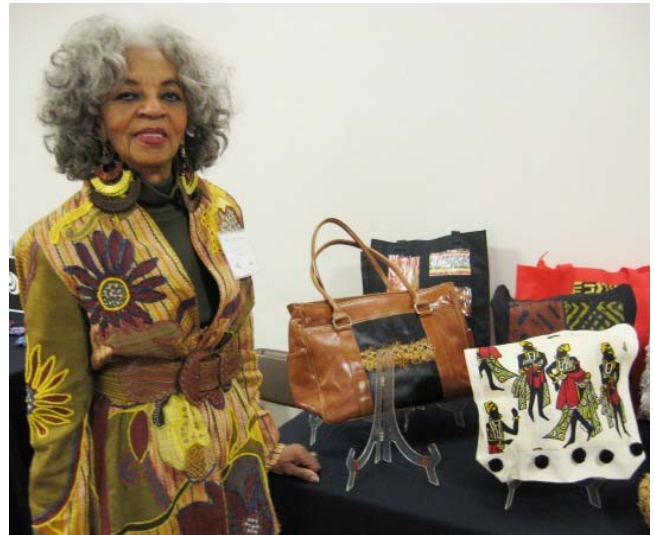
Handmade bags, Art of Aging 2016